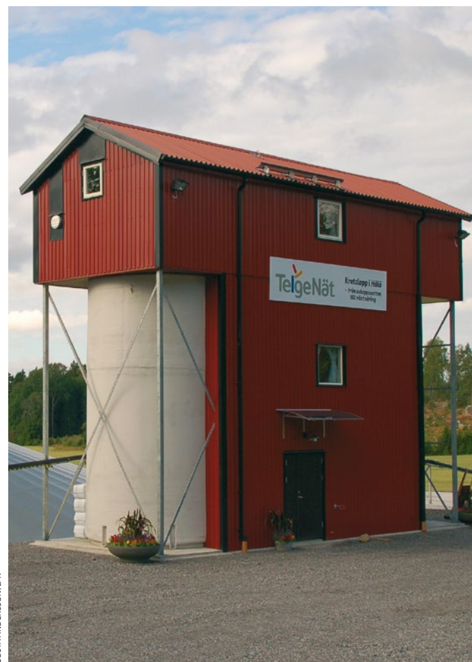
Recycling of nutrients to agricultural fertilisation at the TelgeNät sanitation plant

The BOX-WIN project, implemented by the University of Gothenburg, showed that floating wind turbines, equipped with pumps, may be used for deep water oxygenation, thereby bringing life to dead sea beds and halting the outflow of phosphorus by binding nutrients.