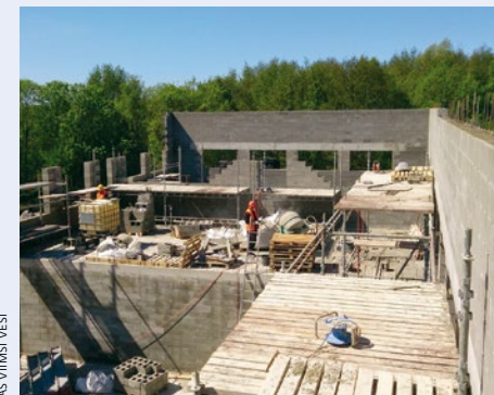
AS VIIMSI VESI

The project has made it possible to construct and renovate the existing wastewater treatment plant in Muuga and to solve the wastewater treatment in a sustainable way for over 18,000 inhabitants of the Viimsi peninsula. The BSAP Fund has partly financed the design of the reconstruction.